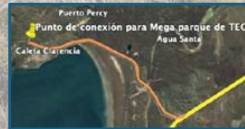
Fibra Austral Route