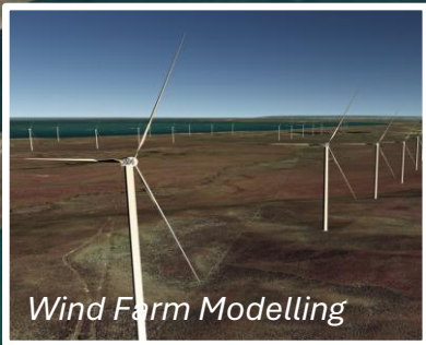
Wind Farm Modelling