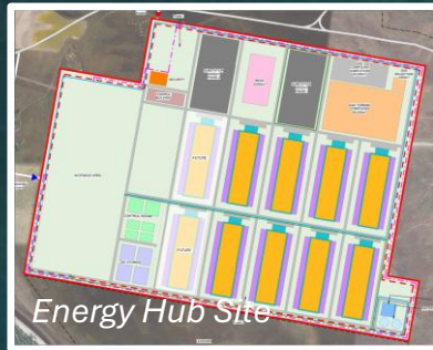
Energy Hub Site