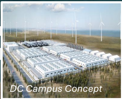
DC Campus Concept