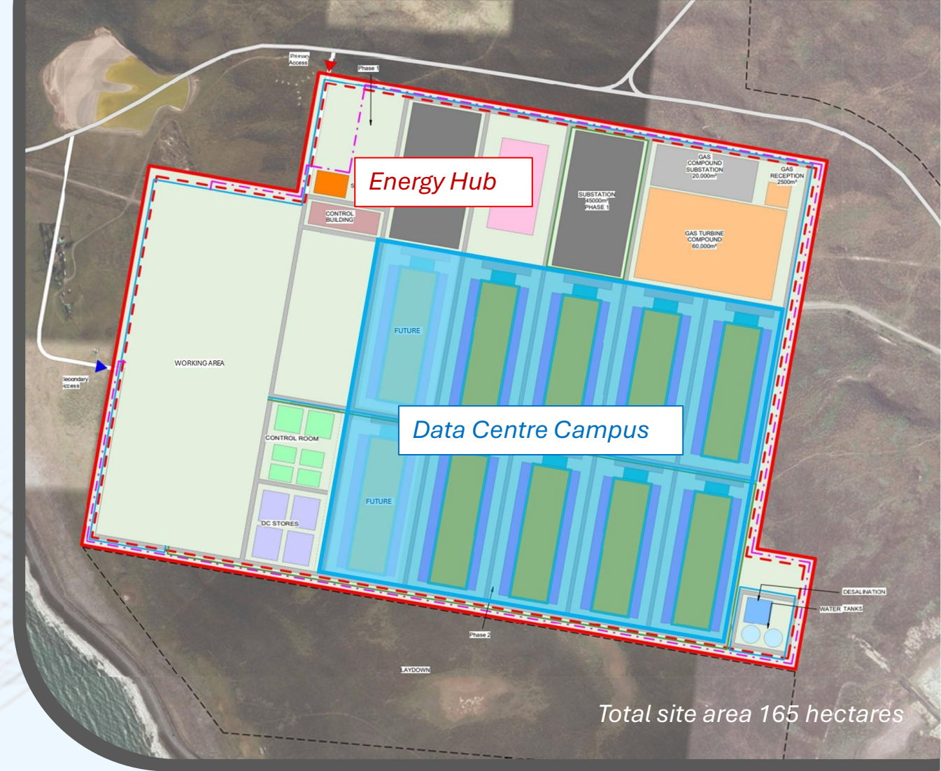
Energy Hub & Data Centre Campus – Layout Concept

The Data Centres are 100MW single-storey buildings with roof-mounted HDAC cooling systems to maximize the PUE advantages of free natural cooling from the low ambient temperatures in southern Chile.